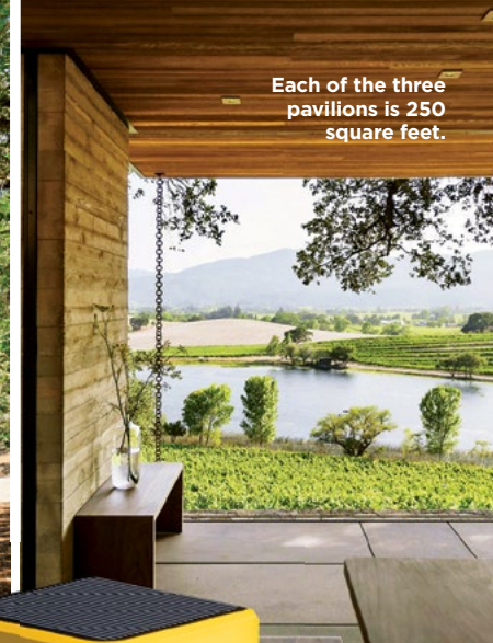
Each of the three pavilions is 250 square feet.