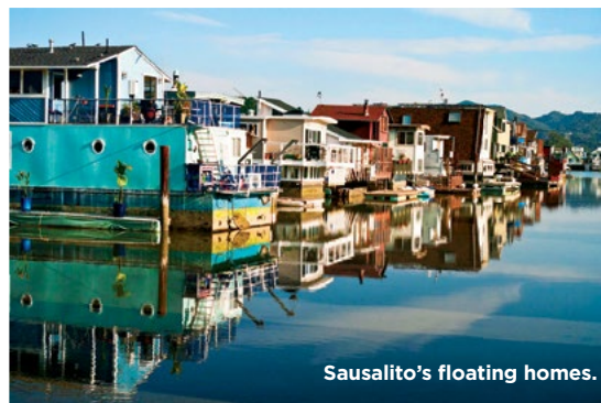
Sausalito's floating homes.