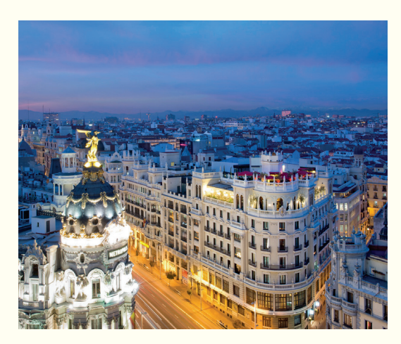
THE PRINCIPAL MADRID HOTEL, MADRID From $271/night; theprincipalmadridhotel.com

Selections from the Surface team's endless list of personal obsessions.