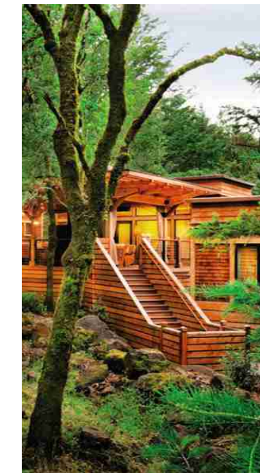
(Top) Guests at Milliken Creek can relax in idyllic surroundings.

Tucked away in three acres of secluded grounds on the Silverado Trail, the twelve-room Milliken Creek has stunning views across the idyllic Napa River. Guests are promised relaxation in plush surroundings, including four-poster beds, open fireplaces and an on-site spa. While there is no restaurant, complimentary wine and cheese are served at sunset in the main house. www.millikencreekinn.com