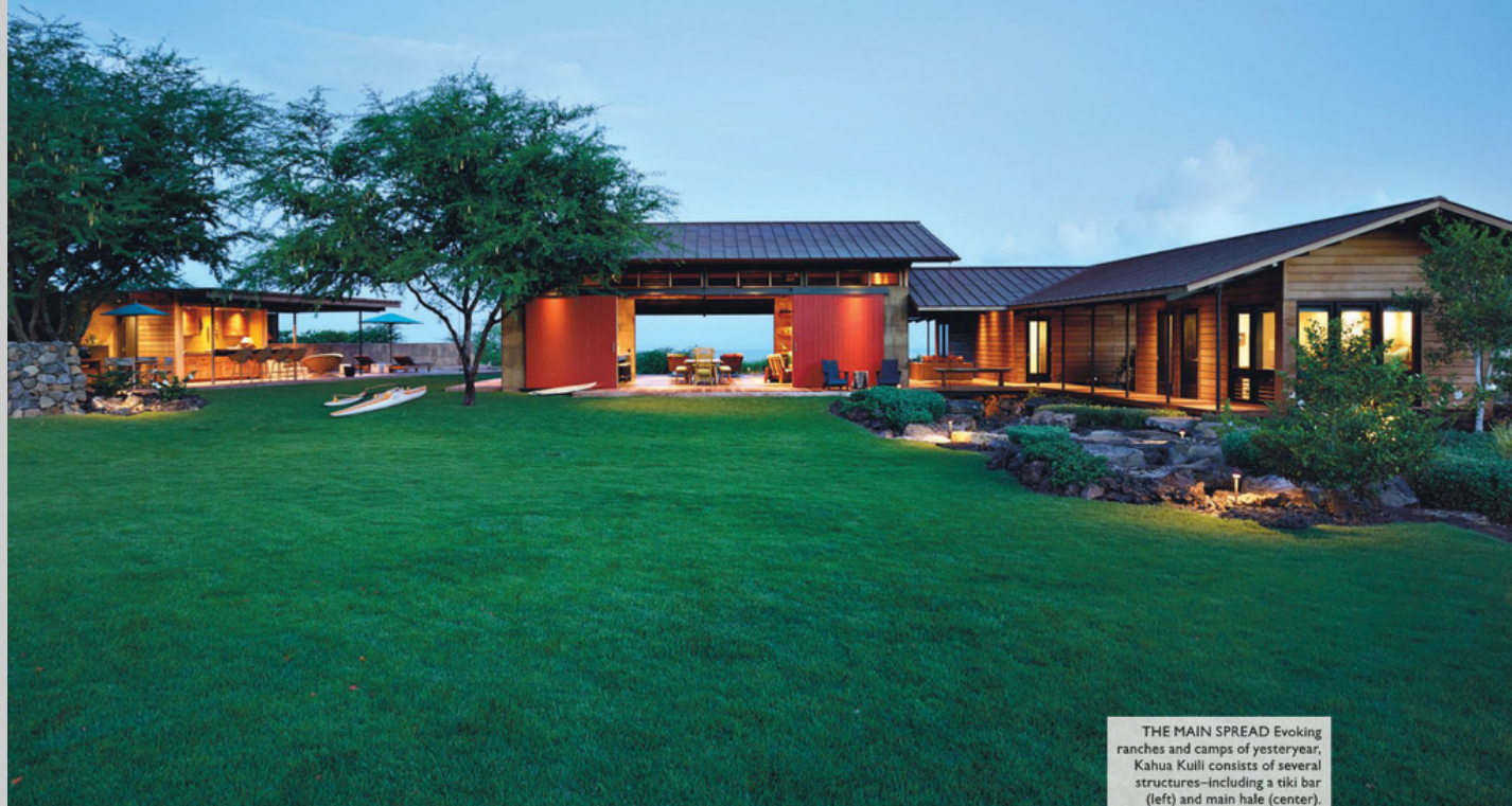
THE MAIN SPREAD Evoking ranches and camps of yesteryear, Kahua Kuili consists of several structures—including a tiki bar (left) and main hale (center).