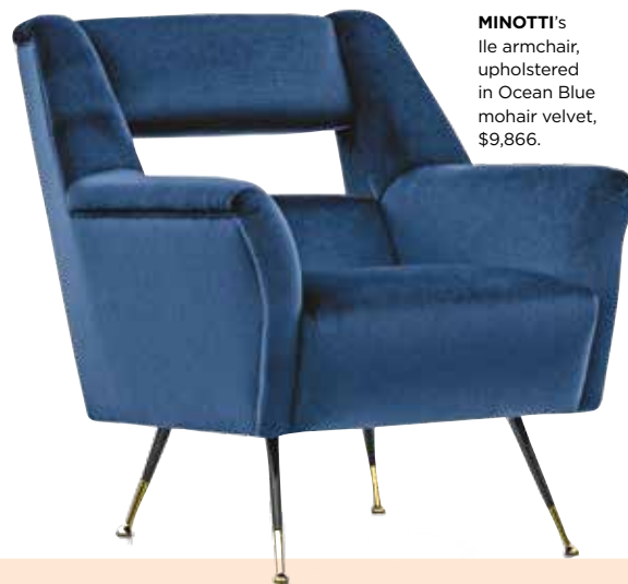
MINOTTI's Ile armchair, upholstered in Ocean Blue mohair velvet, $9,866.